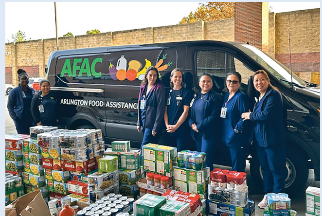
YES We Can Annual Food Drive