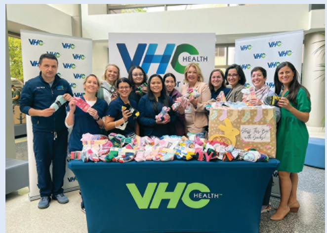
Annual Sock Hop Drive